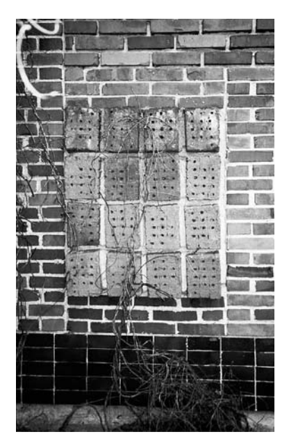
The life-world approach to architecture: detail of Alvar Aalto's experimental house in Muuratsalo.