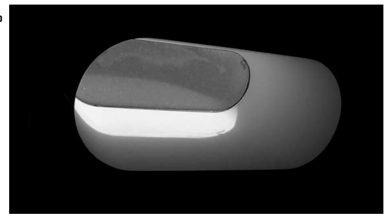
The formalist approach to architecture: detail of the University of Jyväskylä s main building, designed by Alvar Aalto.